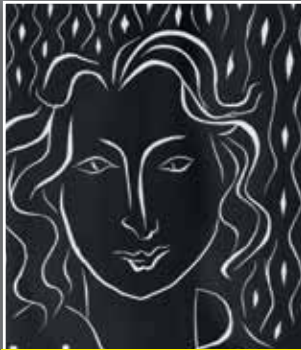
Primavera (Spring) 1938 Linocut on Daragnès wove paper